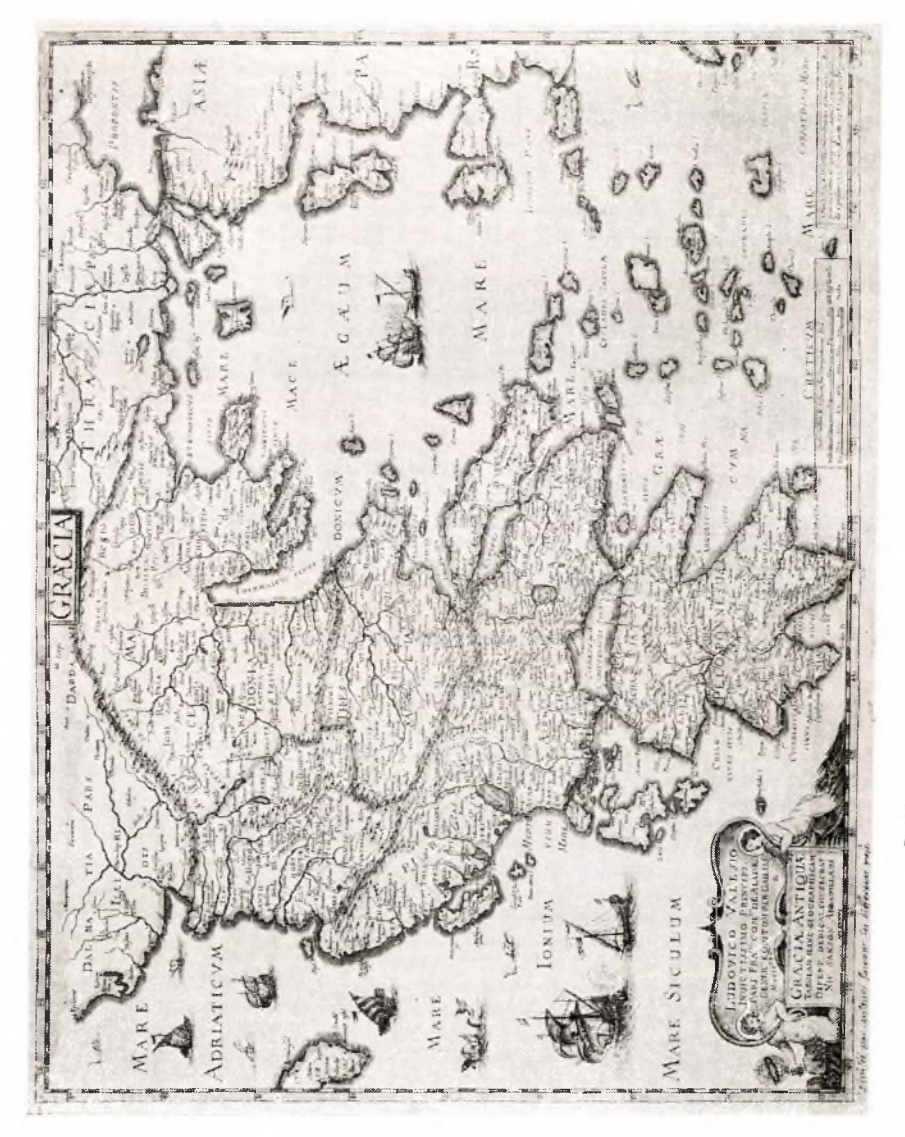
5. N. Sanson and Family, Atlas Nouveau, Paris 1636.