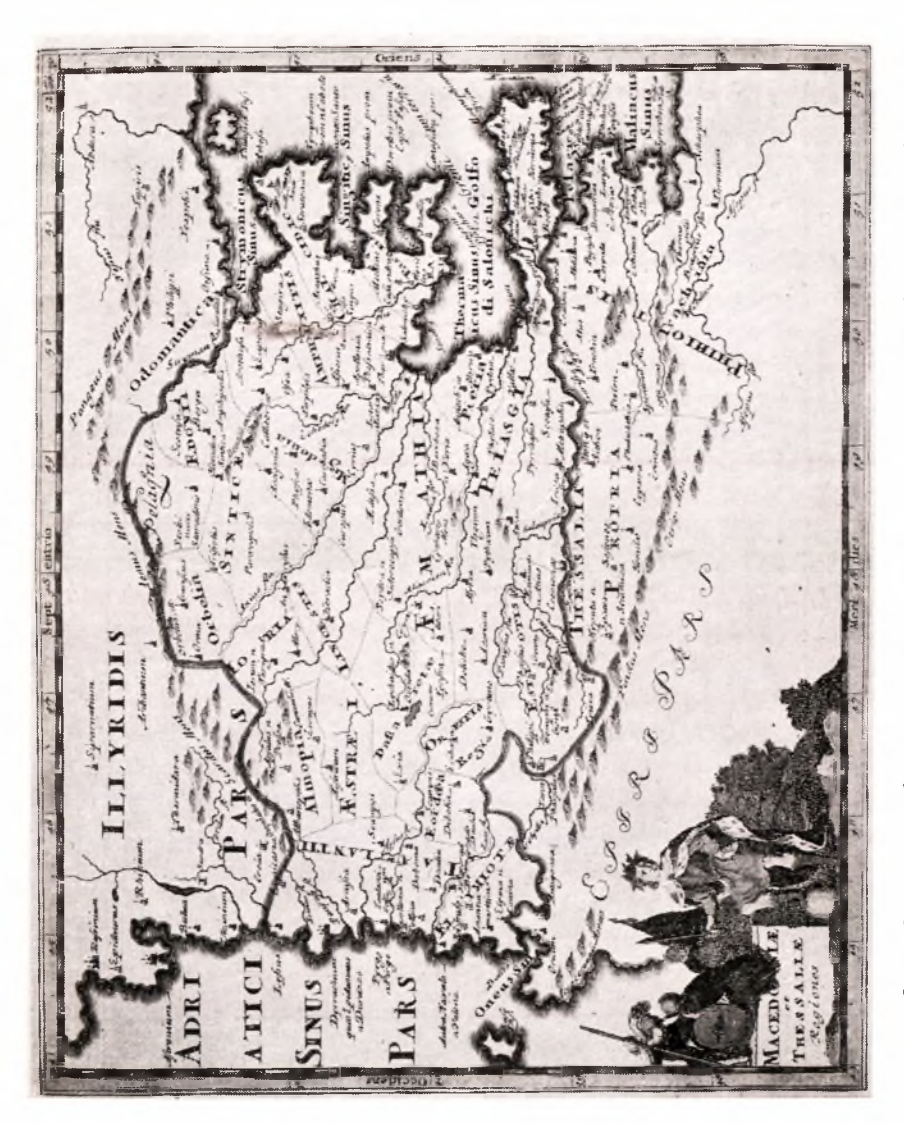
2. P. Cluverius, Introductionis in Universam Geographiam, Map of Macedonia and Thessaly.