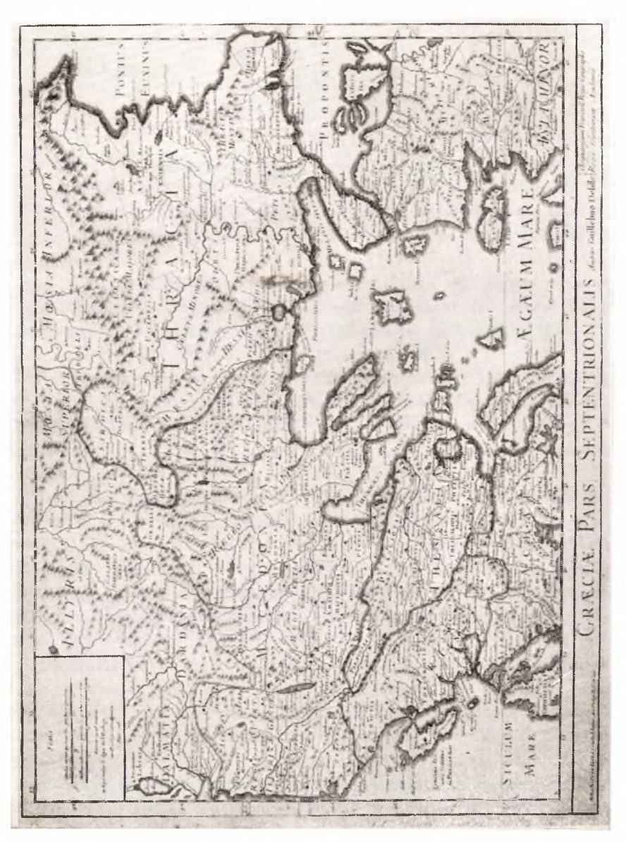
6, G. Delisle, Atlas geographique et Universel, 1700.