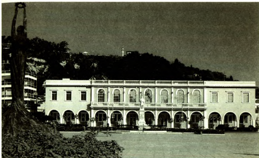
12. Zante. The Museum.