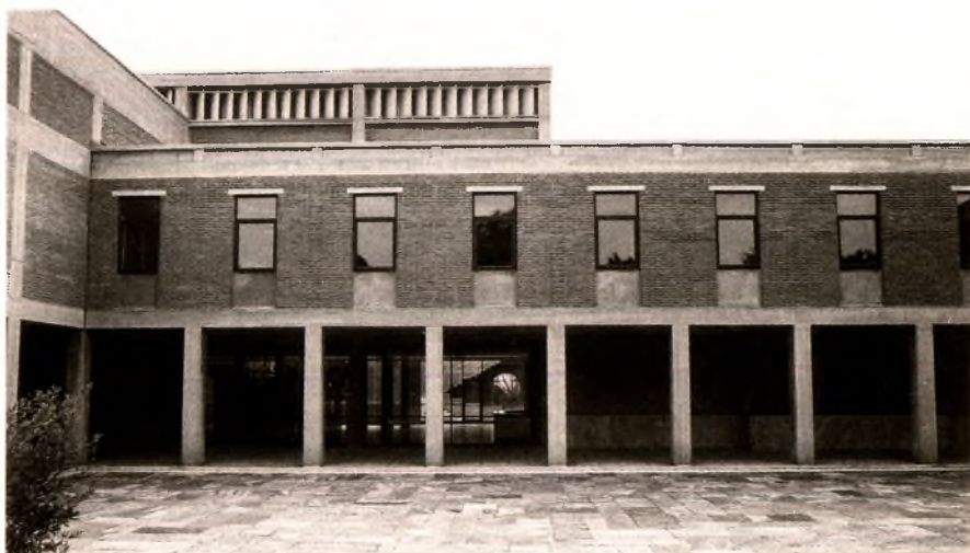
15. Thessaloniki. The Museum of Byzantine Culture.