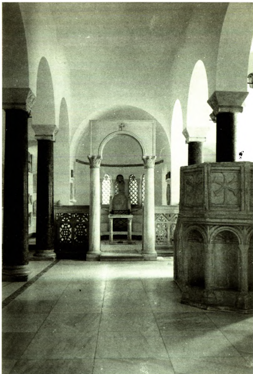
11. Athens. Byzantine Museum. Room imitating an Early Christian basilica.