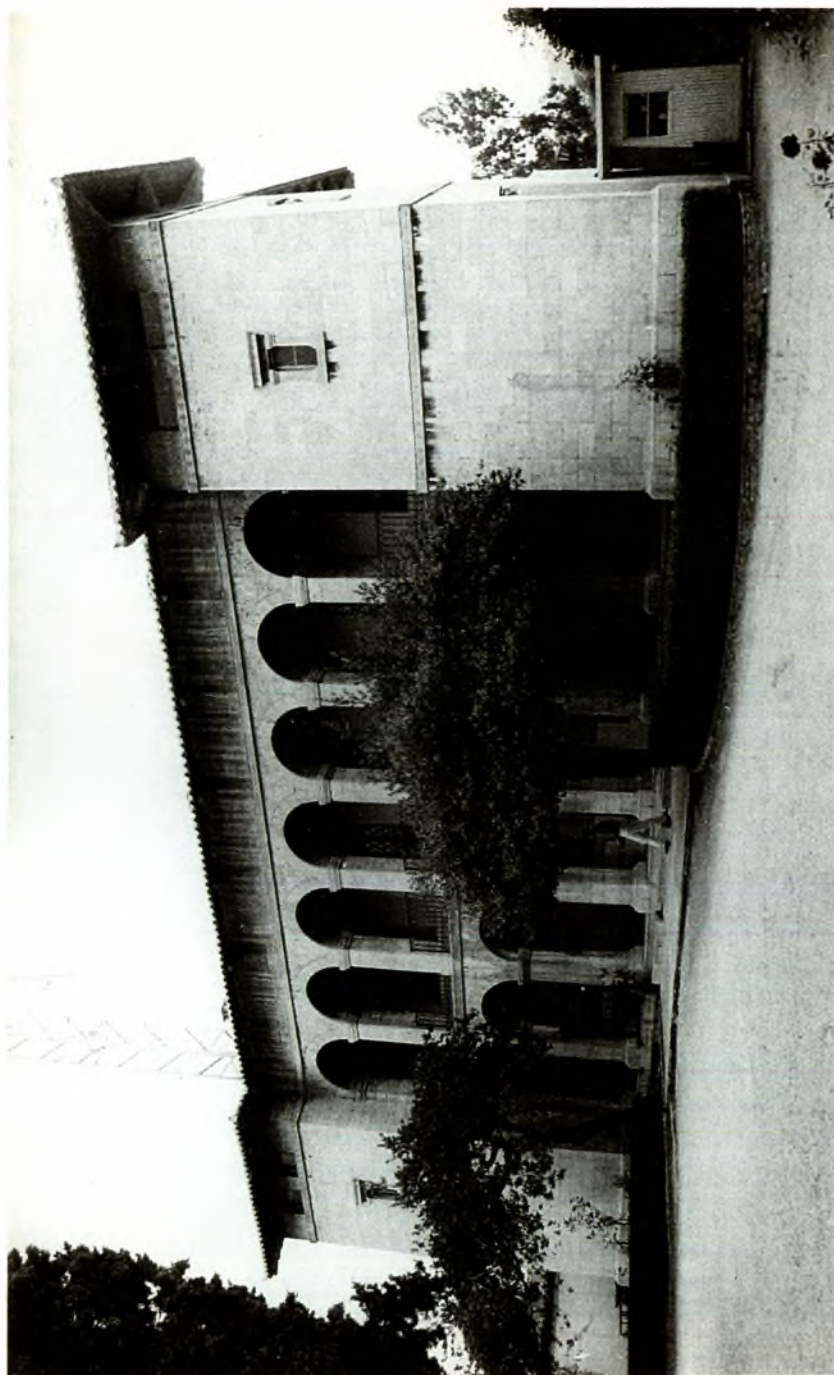
8. Athens. Byzantine Museum. The main building.