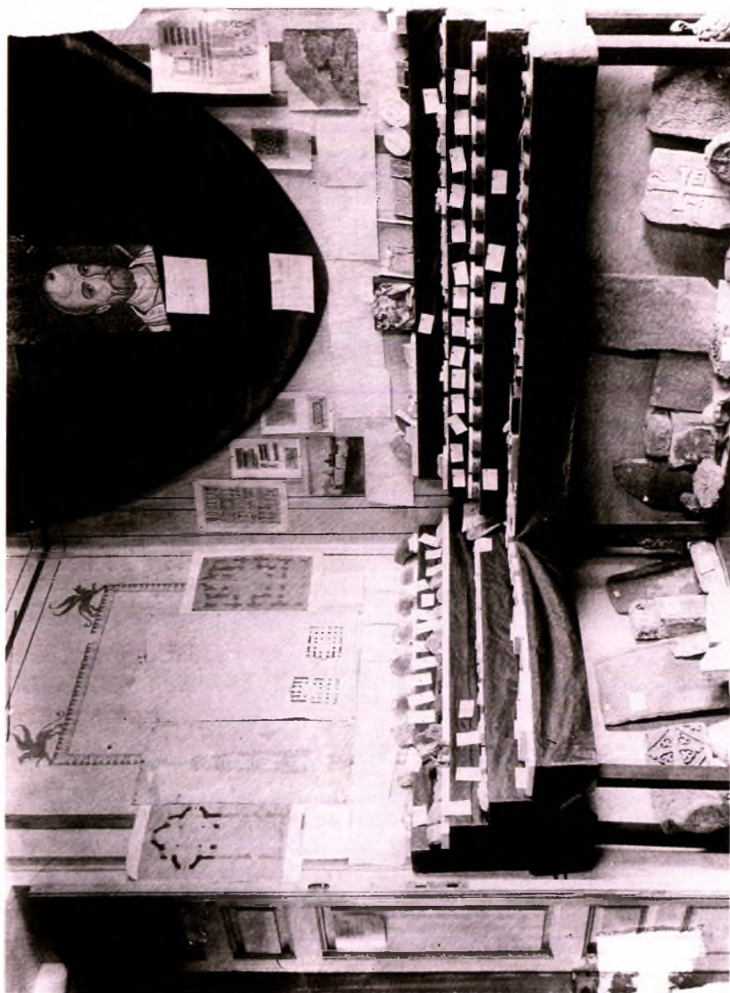
5. Athens. The Museum of the Christian Archaeological Society on 4th March 1893 (Photo: Byzantine Museum, Athens, Lampakis Archive, neg. A. 1470 α).