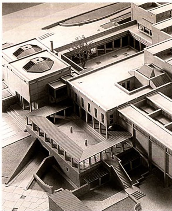
14. Thessaloniki. Museum of Byzantine Culture. A model of the building.