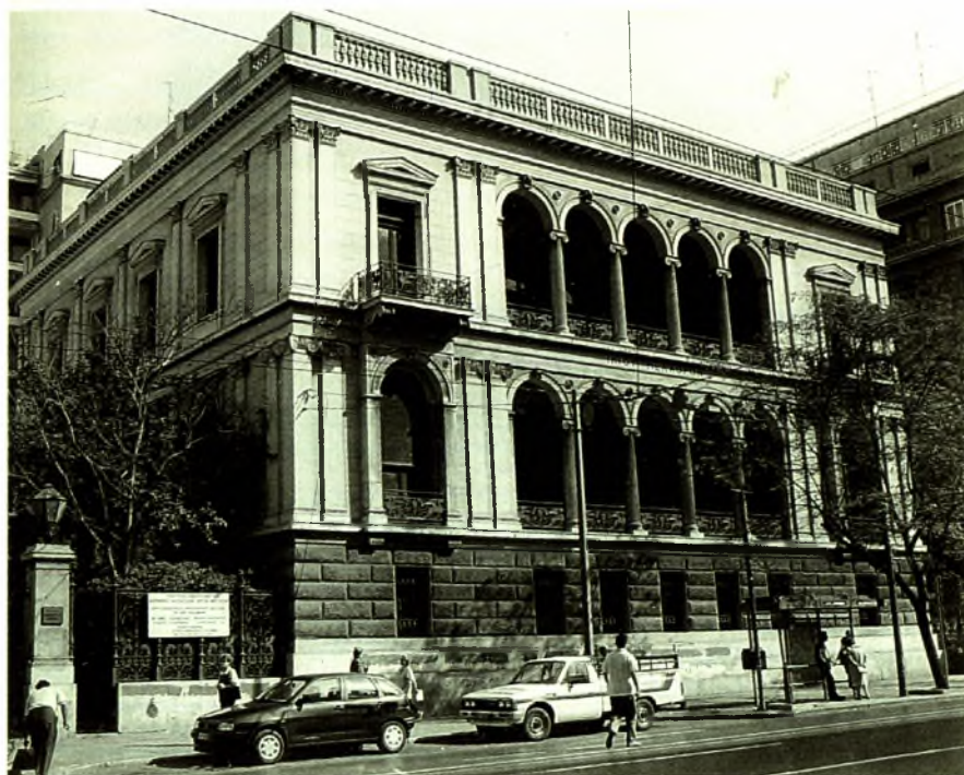
13. Athens. The Iliou Melathron.