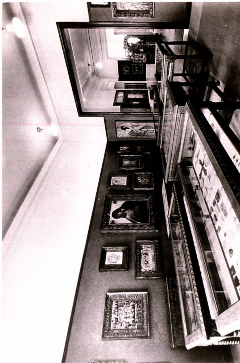
10. Athens. Benaki Museum. Two of the Byzantine rooms in the early 1930s.