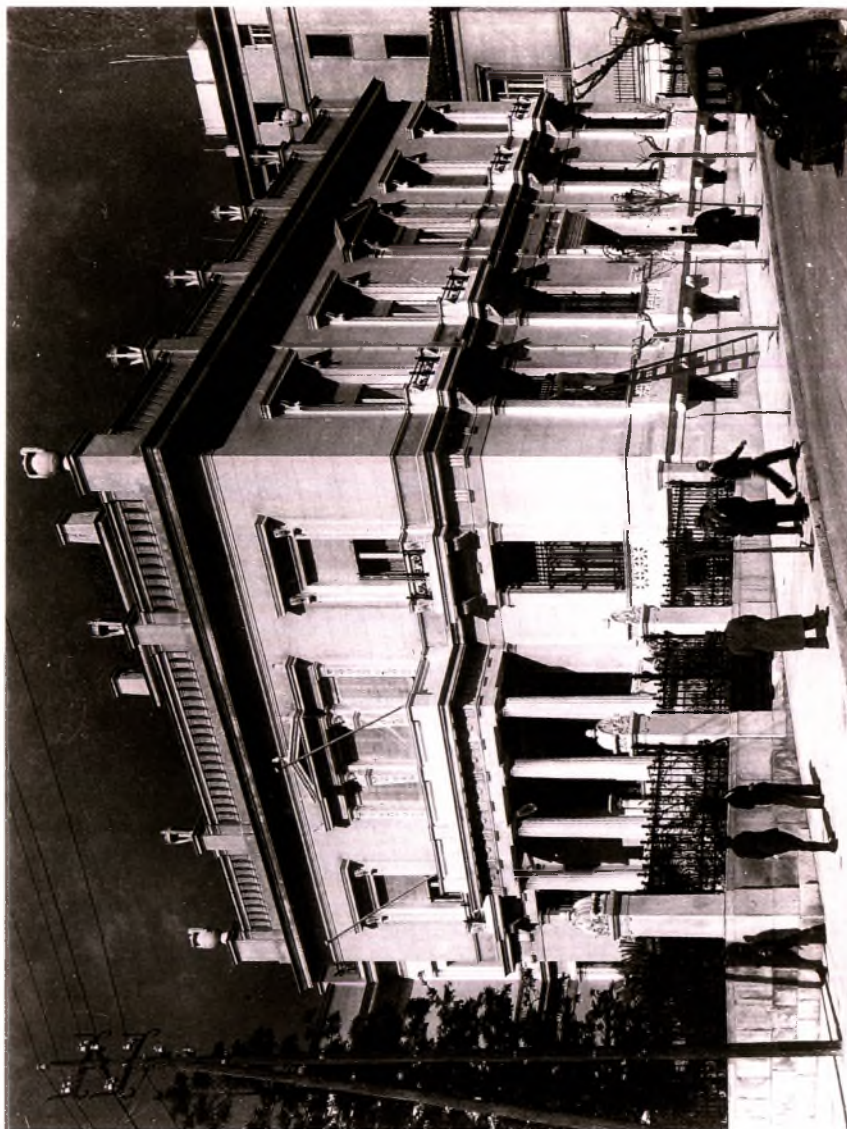
9. Athens. The Benaki Museum around 1930.