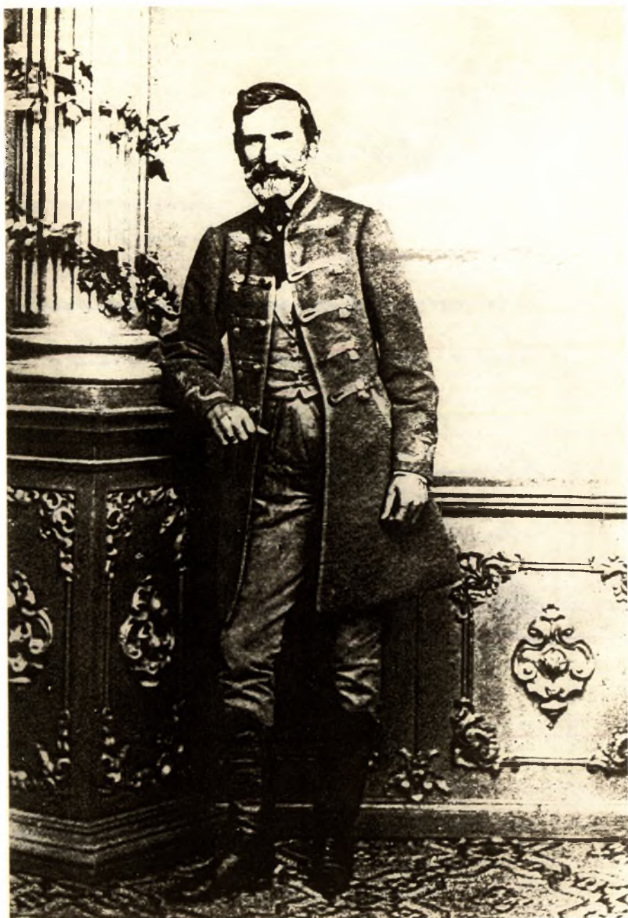
3. The reproduction of picture of Pál Kiss painted in 1862.