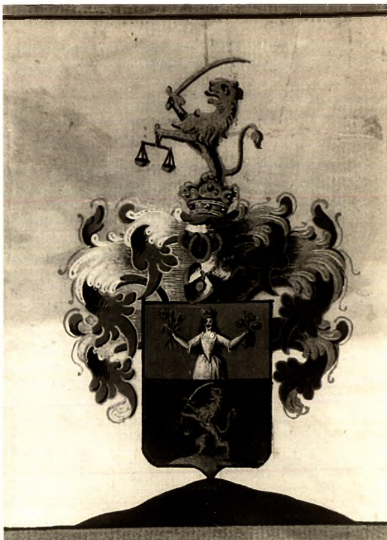
1. Coat-of-arms of Pál Kiss.